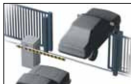
automatic p.a.m.s. sequencing with slide and swing gates