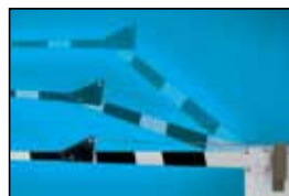
folding arm kits available for low headroom applications