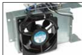
fan/heater kits options available for extreme weather conditions